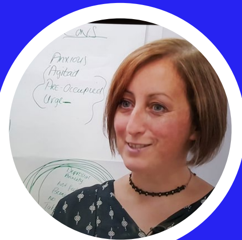
Gill Volunteer Support