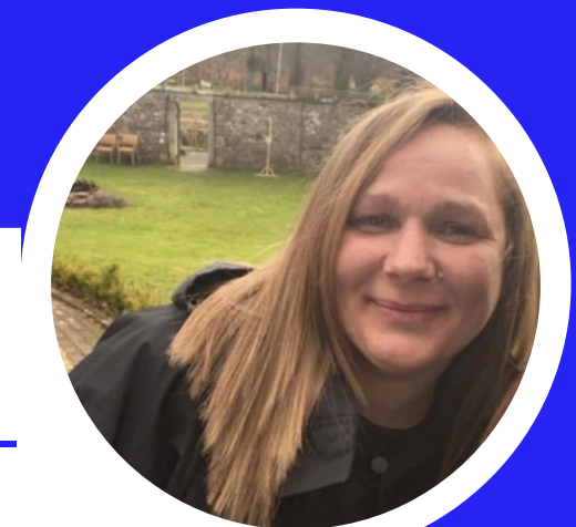
Jacks Addiction Worker - Trainee